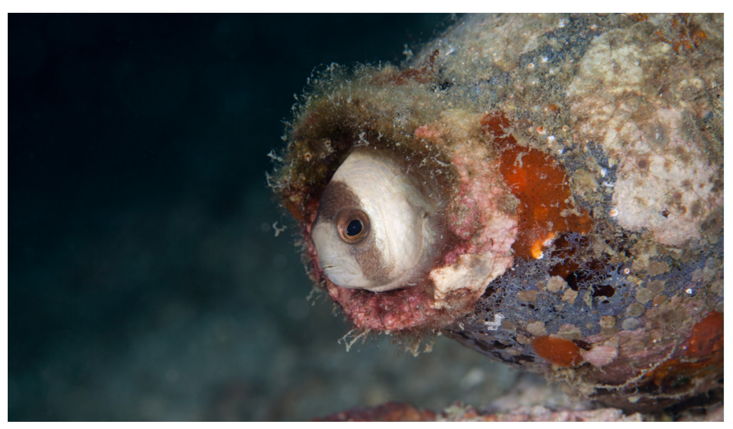
Environmental Investigation Agency and OceanCare

Front cover: Plastic pollution washing up on a beach in Asia. Below: Fish living in plastic bottle.