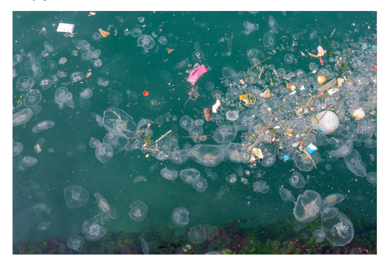
Above: Jellyfish at surface of ocean surrounded by floating marine plastcs.

The Zero Draft of a new Global Plastics Treaty provided in advance to INC-3 provides a firm basis for discussion on remediation and should be retained and strengthened. Here, we summarise a number of recommendations for policy-makers when assessing these elements to ensure remediation is conducted in the context of restoration and social well-being, is environmentally sound and is responsive to the special circumstances of SIDS, LDCs and other developing countries.