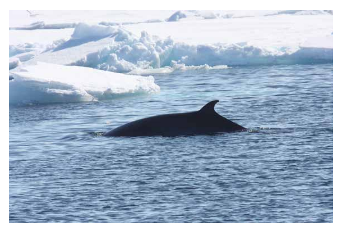
A north Atlantic minke whale off Svalbard, Norway.

In recent years, expanding whaling by Japan and Iceland has dominated both headlines and diplomacy; Japan lost a legal challenge to its special permit or 'scientific' whaling programme at the International Court of Justice and Iceland remains the target of diplomatic sanctions by the United States. In contrast, Norway has been spared international attention and diplomatic pressure, and has made the most of this vacuum. Since 2010, the Norwegian government has continued to use an unapproved method to set its quotas, and relaxed a number of whaling regulations that it originally introduced in response to criticism by the IWC. It has subsidised research into new uses of whale oil and other products and quietly prepared the ground for increased exports, resulting in nearly 150 tonnes of whale meat and blubber being exported to Japan. It has also become less transparent about the welfare implications of its hunt.