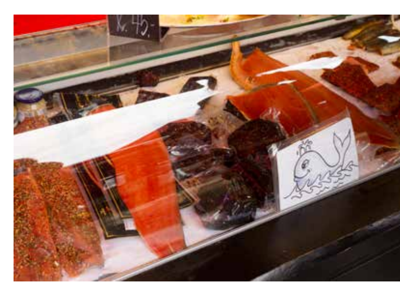
Fresh whale meat steaks on sale in 2014 at a fish market in Bergen, southeast Norway.

At its 64<sup>th</sup> Meeting in 2012, the IWC unanimously passed Resolution 2012-1, which recalls that organic contaminants and heavy metals '... may have a significant negative health effect on consumers of products from these marine mammals' and urges parties to '... responsibly inform consumers about positive and negative health effects, related to consumption of some cetacean products'.