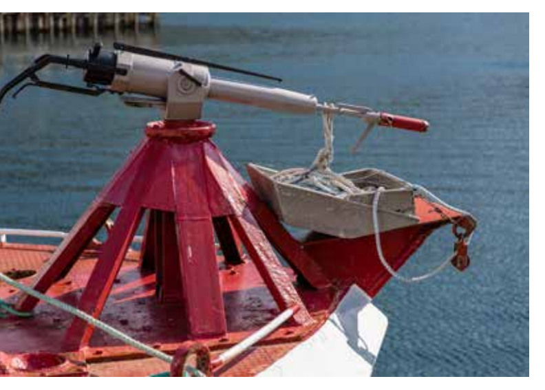
Norwegian explosive harpoon. 18 percent of harpooned minke whales in Norway do not die instantaneously.

Norwegians are split over whaling and apparently ambivalent about its humaneness; according to polls, 31 percent support whaling, regardless of potential suffering of the animals, but 42 percent oppose whaling if some whales suffer before dying.<sup>120</sup>