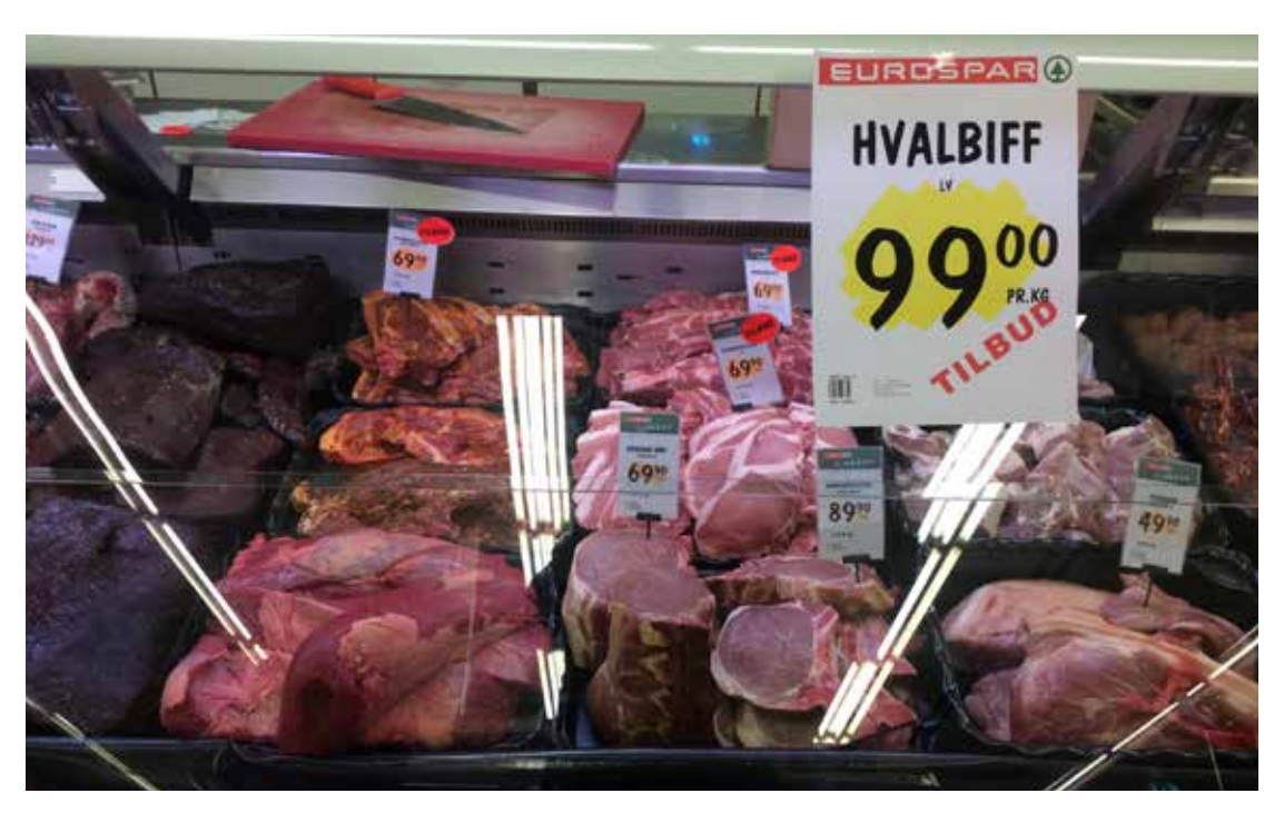
The Netherlands-based SPAR group continues to defy international condemnation by selling whale meat in its Norwegian outlets. (Paul Thompson)

From 2004 to 2009, the public relations programme cost US$400,000/year.92 Although it did not immediately result in the desired effect, 93 revenues at several of the leading whale meat companies have increased in recent years. For example, Lofothval's