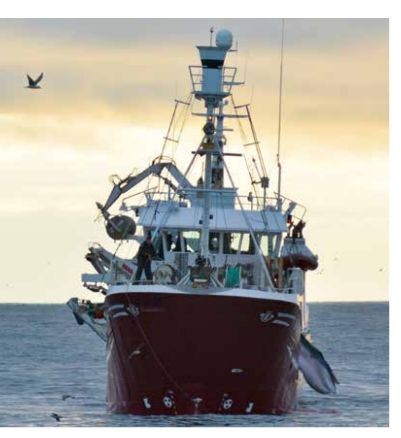
Norwegian whaling ship 'Reinebuen' south of Svalbard, May 30, 2015

With the attention of media, politicians and the public focused elsewhere since the beginning of the new century, Norwegian whaling has boomed, exploiting loopholes in international whaling and trade bans and using unapproved science to set its own quotas for hundreds - sometimes more than a thousand whales a year. Now with its domestic market for whale meat saturated due to low demand, Norway is not only exporting meat to established markets in Japan, it is even funding the development of new foodsupplement and pharmaceutical products derived from whale oil in an effort to secure new customers, both at home and abroad.