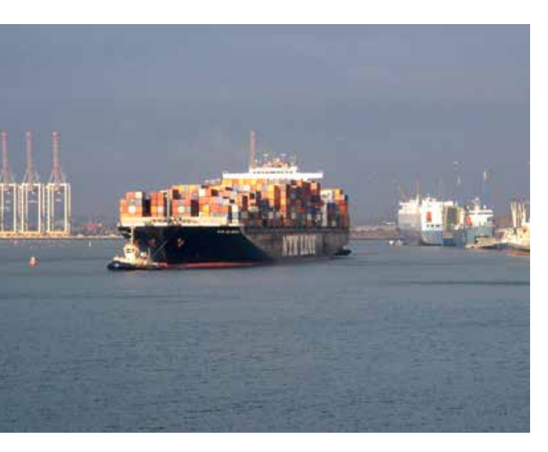
In early 2013, Japan's NYK line ship 'Olympus' transported over four tonnes of Norwegian whale products to Japan. (Keith Murray)

The Convention on International Trade in Endangered Species of Wild Fauna and Flora was agreed to in March 1973 and entered into force in July 1975. Large whales were among the first species protected under CITES: At the first CITES CoP in 1976, blue, humpback, gray and right whales were listed in Appendix I (effectively banning international commercial trade). At CoP2 in 1979, all great whales were included either in Appendix I or II (i.e., international trade restrictions). At CoP3 in 1981, fin, sei and sperm whales were transferred to Appendix I, with the result that all whales then protected by the IWC also received CITES's strongest protection. In 1986, CITES responded to the IWC moratorium by including the last remaining great whales in Appendix I.46 However, like the ICRW, CITES allows parties to lodge a formal reservation within 90 days of a CITES decision, exempting them from its effect.