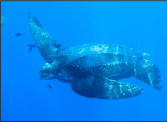
Figure 3. Underwater image from video, showing several of the accompanying pilot fish as well as a Mediterranean jelly on the upper left.

attempt to avoid the boat but swam directly toward it, passing under the keel and to the opposite side, at about 1 m depth. Subsequent surfacing intervals were likely affected by this close approach, although the animal soon resumed its original dive pattern (Fig. 2).