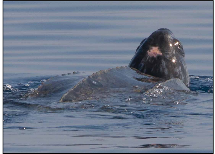
Figure 4. The "pink spot" on top of the leatherback's head, the contour of which may be used for individual identification.