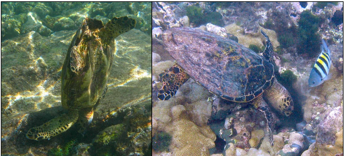
Figure 1. Live immature hawksbill turtles feeding on Zoanthus sociatus at the Abrolhos Archipelago.

On 18 March 2015, at 3:50 PM local time, while snorkeling at a protected bay (Mato Verde) of Santa Barbara Island, we observed an